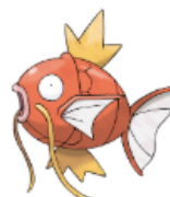
Magikarp Magic + Carp

7: Write the Japanese meanings for these Pokemon names: