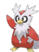
Delibird Delivery + Bird