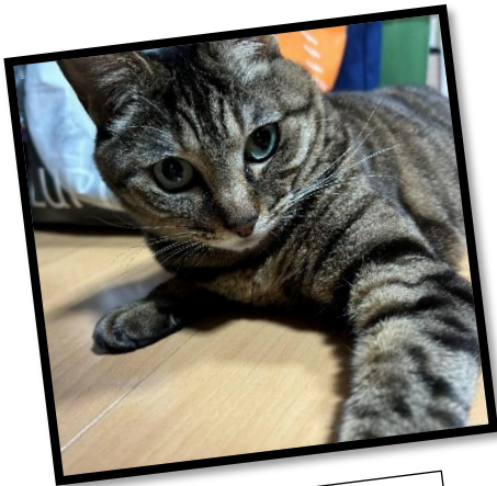
A secret cat

We have heard that some people call Keika Boys' School... 'a zoo'! What do you think about that? Here are some Keika Girls' School pets... so does that make Keika a 'petting zoo?' Get the joke? ;D