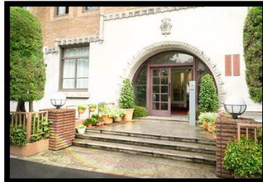
The Old Building