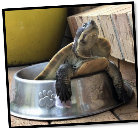
Terrance the turtle