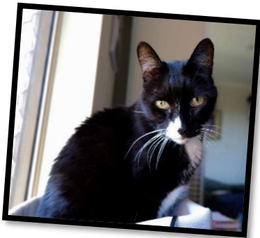
Tux the tuxedo cat