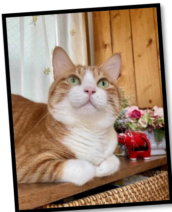
Toukichirou the cat