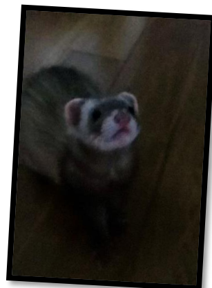
Mochiko the ferret