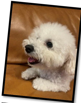
Tofu the dog