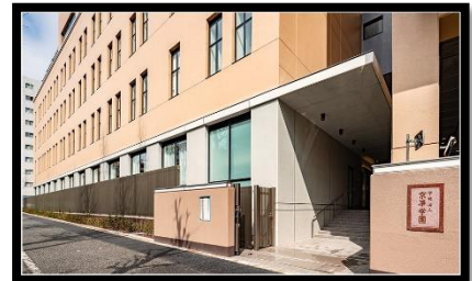
The New Building