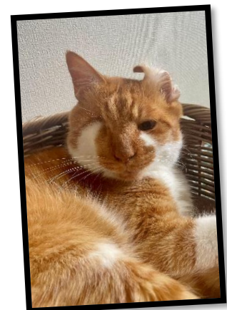
Bontenmaru the cat